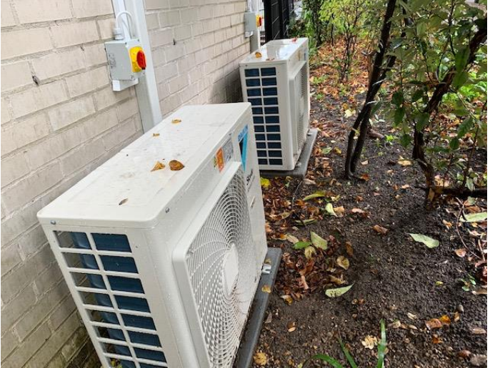
Year 4, 5 and 6 Classrooms: exterior front and back – six condensers serving six classrooms